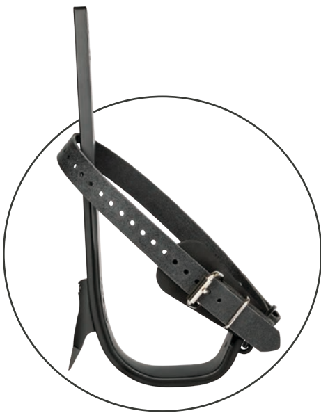
BuckAlloy™ Black Climber A94089A-BL

THE MOST DURABLE LIGHTWEIGHT CLIMBER IN THE INDUSTRY.