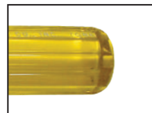
No Accessory Ring