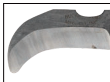
Notched, Blunt Tip