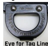
Eye for Tag Line