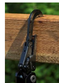
Fig. 4 - Not for Human Support