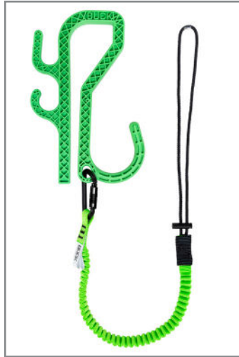
Bucket Hook w/Tether Hole & Tool Tether 2410T