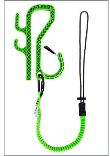
Bucket Hook w/Tether Hole, Gate & Tool Tether 2410GT

Features an outside hook w/ stainless-steel wire gate that provides extra security.