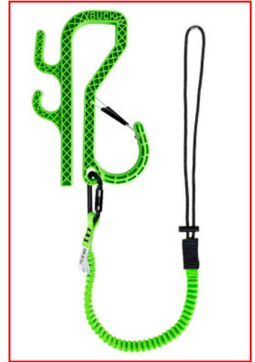
Bucket Hook w/Tether Hole, Gate & Tool Tether 2410GT

Features an outside hook w/ stainless-steel wire gate that provides extra security.